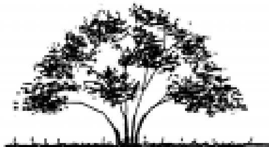
Chaparral Shrub After Pruning

100% vegetation coverage- no spaces between plants